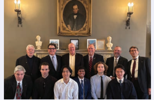
Alumni (back row and bottom left) attend the initiation of Kappa's newest recruits (front row).

The November initiation stands as another proud milestone for the Kappa Chapter, honoring its heritage while welcoming a new generation of Brothers dedicated to carrying its values forward.