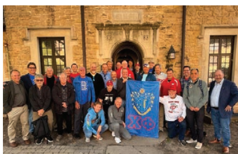
Chi Phi Alumni gather at Reunion Weekend 2025 in Madison to celebrate tradition, Brotherhood, and lifelong bonds!

This past September, Alumni gathered in Madison for the 2025 Reunion Weekend to celebrate lifelong connections and the enduring Brotherhood of Chi Phi. Participants representing classes from 1966 through 2015 came together to reconnect, share memories, and strengthen momentum for the future.